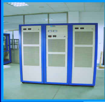
Dynamic Solutions 120kva Replacement Amplifier for an Unholtz-Dickie T-1000