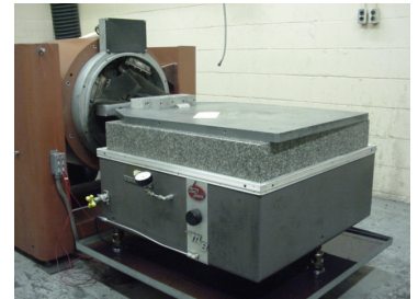
Used Ling 395 Shaker with Stand Alone Slip Table

Typically a used shaker system costs a fraction of the price of a new system, which means more force for your dollar. So, next time you think you can't afford what you need – give us a call. You might just be surprised how far we can stretch your dollar!